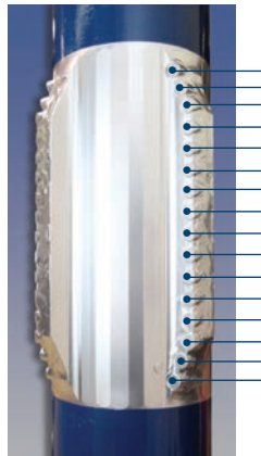
Phantom PDC Reamer

The Phantom PDC Reamer has documented successful runs in the Bakken, Barnett, Haynesville and Eagle Ford shale regions.